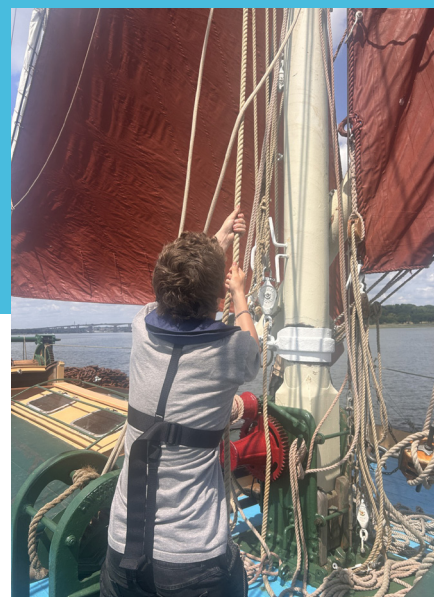
Students worked with crew members of sailing barge The Victor and learnt about maritime history

"Several pupils have since expressed a desire to own a boat and get back out on the water – an incredible testament to the impact of the day. There's no doubt that this inspiration is thanks to the calm, engaging, and welcoming approach of the Victor crew.