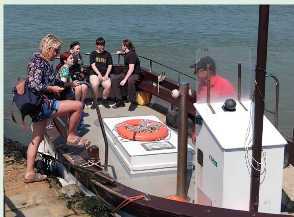
Students take the ferry to Old Felixstowe

"We are incredibly proud of all the students who took part and thankful to the Wolsey 550 group and the crew of The Victor for making this enriching experience possible."