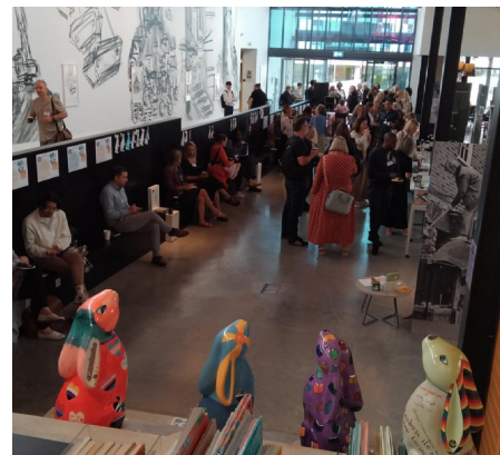
Various trips have been arranged to help students choose their next steps

already secured. Some have even landed their first part-time jobs since completing their GCSEs - a fantastic achievement that reflects the skills and confidence they've developed through our post-16 support.