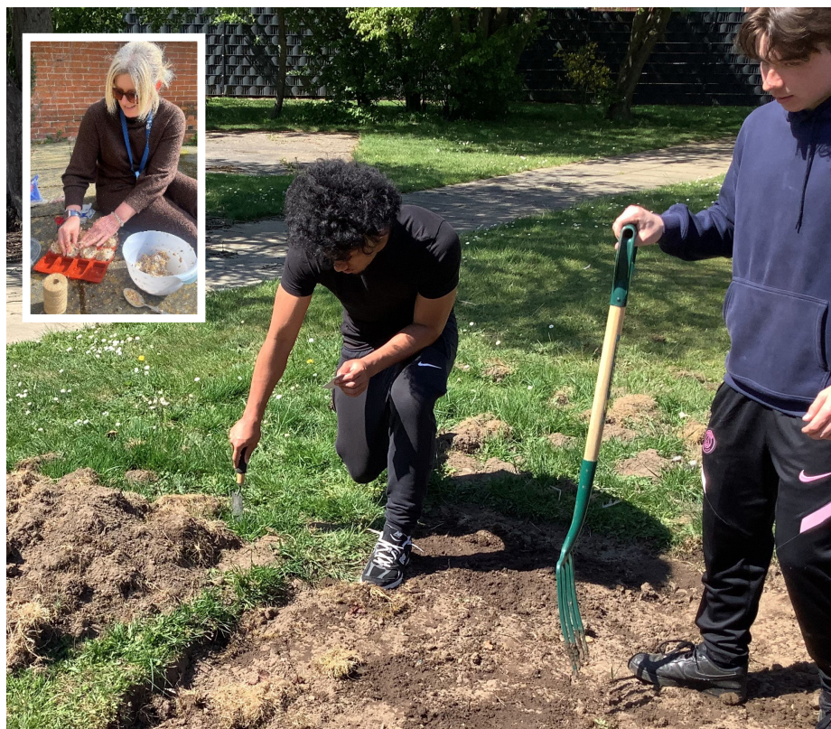
Staff have pitched in to clean up green areas, feeding birds and planting herbs