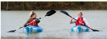
Getting on the water for kayaking

The packs are full of interactive wellbeing cards with personalised messages from their Head Teacher and the chaplains.