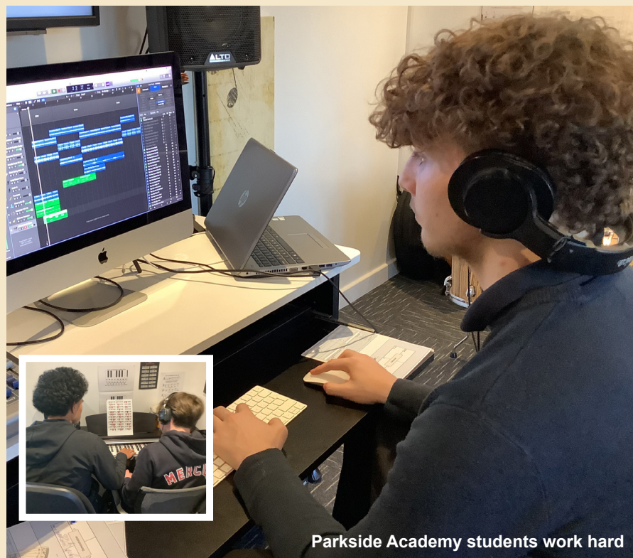
Parkside Academy students work hard