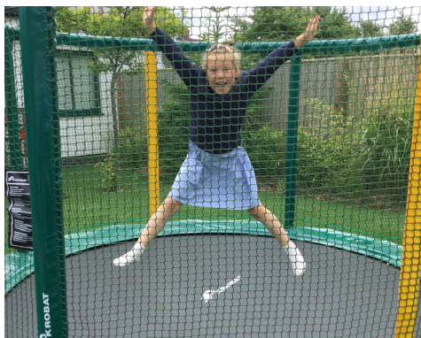
Children were jumping for joy after the new equipment was installed

Children now have new artificial grass, a sunken trampoline, and a core strength climbing area built with logs, nets and a pull-up bar. The core strength area is made out of all natural materials, giving children an exciting new area for them to play in.