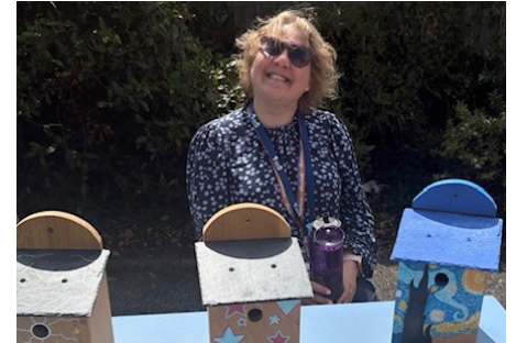
Activities at St Christopher's raised awareness of mental health

Together, the group raised more than £200 for the pupils' chosen charity, 4YP. Some of the pupils had used this service and wanted to give something back.