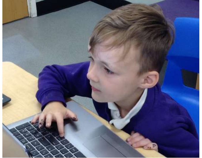
STUDENTS at First Base have been putting their computing skills to good use by typing labels and captions as part of their English work.