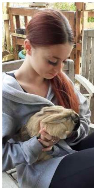
OUR students making new friends at the community care farm.