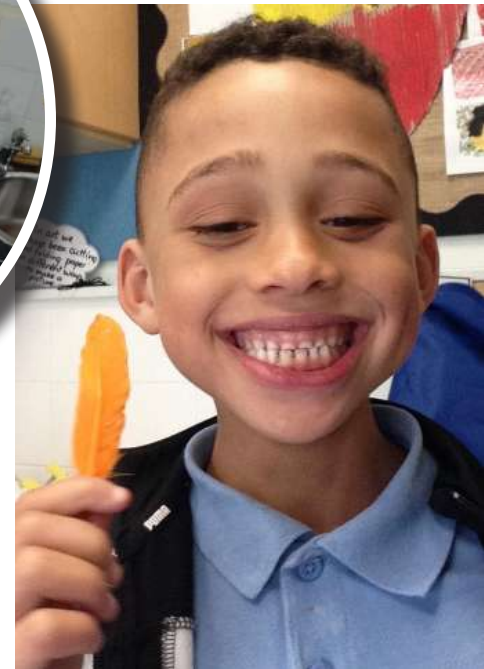
Our Thrive students have been exploring facial expressions and laughter by tickling each other's faces with feathers.