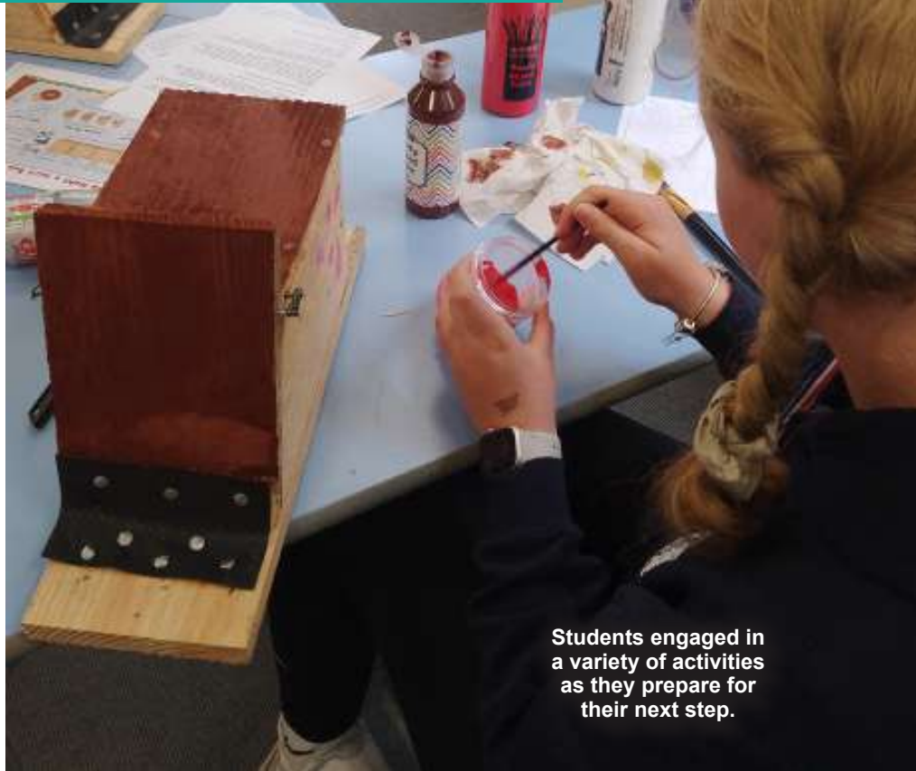
Students engaged in a variety of activities as they prepare for their next step.

Other activities included sewing lessons, creating jars of joy and yearbooks for staff to leave comments in.