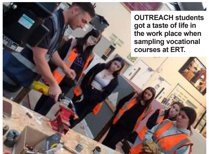
OUTREACH students got a taste of life in the work place when sampling vocational courses at ERT.