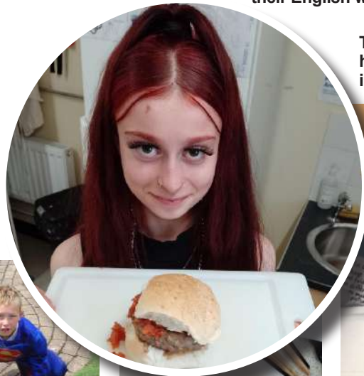
THE amazing Porsha (left) has been cooking up a treat in food tech.