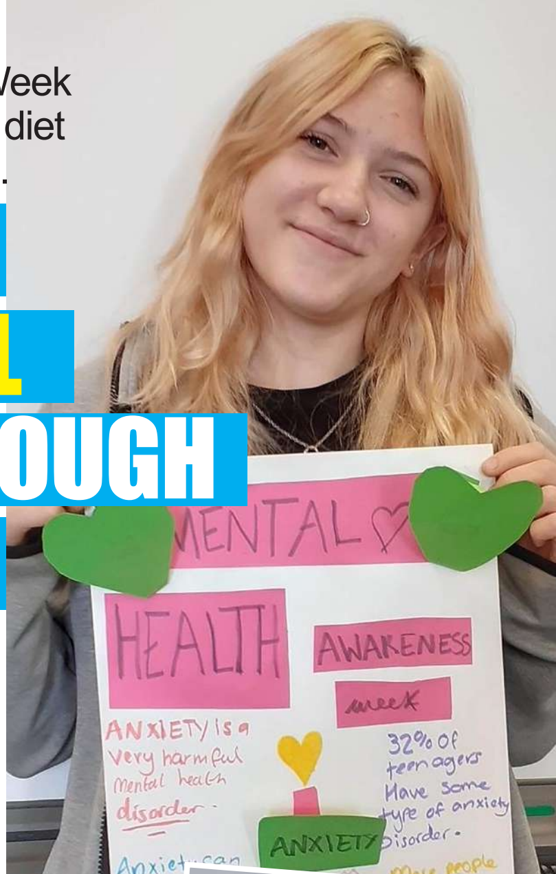
Students let their creativity flow to support Mental Health Awareness Week.

"It highlighted to us that everyone has mental health and we need to take care of it."