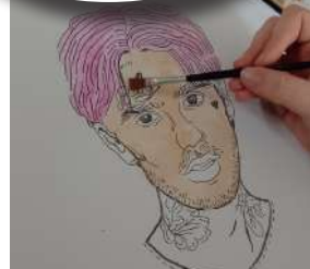
STUDENTS have been sketching using carbon paper and painting with watercolours at our new art club at Westbridge.