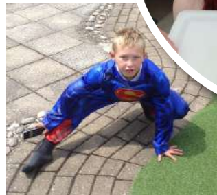
SUNSHINE and superheroes are a great combination at First Base Ipswich.