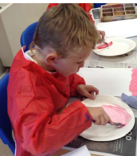
OUR Raccoon Class at First Base Ipswich have been using their creative skills in art class.