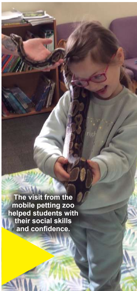
The visit from the mobile petting zoo helped students with their social skills and confidence.

"It's good for them to see new people. They know that they could grow up and have a job working with lovely animals."