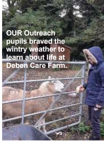
OUR Outreach pupils braved the wintry weather to learn about life at Deben Care Farm.