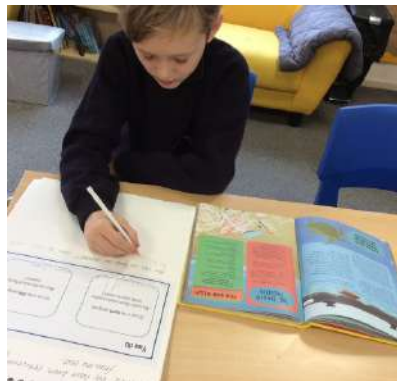
OUR Alderwood Academy students have been recording ideas on how to save the oceans from plastic using our Readers for Life Curriculum and the text Rise Up.