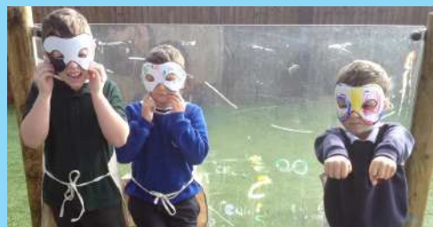
FIRST Base pupils made their own costumes for their superheroes' project.