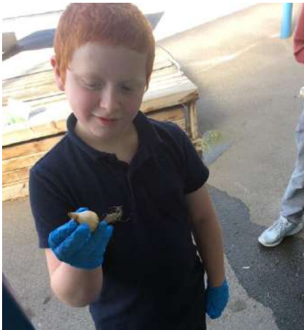
OUR happy planters have been learning about growing vegetables. Gardening is linked to good mental health and wellbeing.