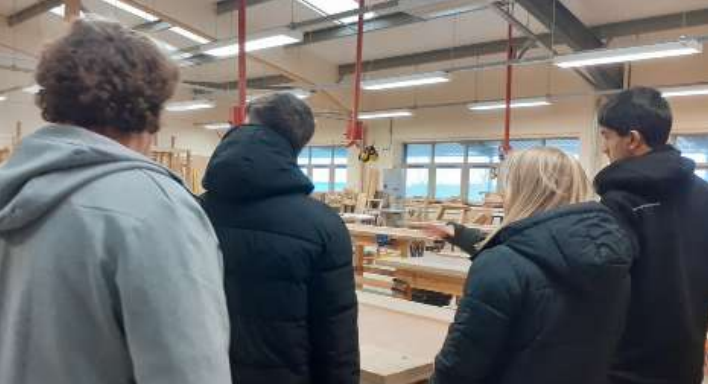
OUR Outreach students explored their post-16 options by participating in animal care workshops and joinery on a visit to Otley College.