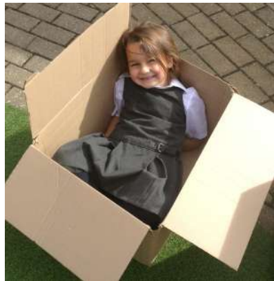
WHO needs toys when boxes are so much fun!