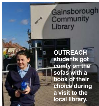
Gainsborough Community Library