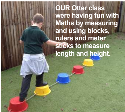
OUR Otter class were having fun with Maths by measuring and using blocks, rulers and meter sticks to measure length and height.