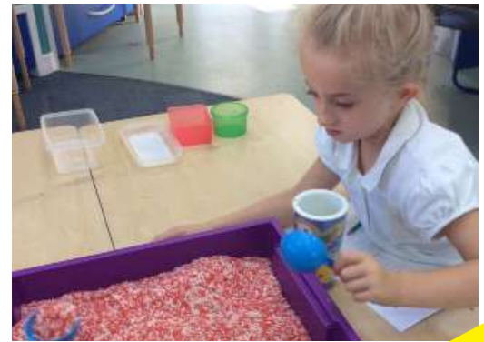
FIRST Base students learned all about capacity in Maths by filling up pom-pom jars. Their reward was to make biscuits.