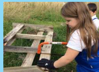
OUR pupils recycled an old wooden bench for fire wood using a bow saw at Forest School.