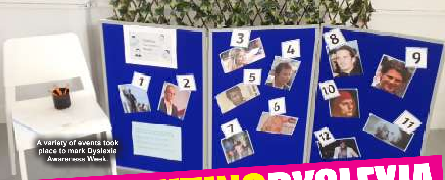
A variety of events took place to mark Dyslexia Awareness Week.