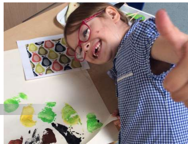
OUR pupils have been inspired by the prints of Orla Kiely to create their own works of art.