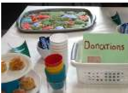
TASTY cakes were the talk of the Trust as staff and students raised money for MacMillan Cancer Support at a special coffee morning.